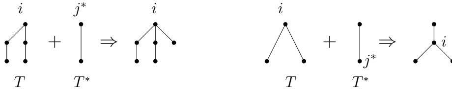
FIGURE 1. A horizontal merge and vertical merge.

If j^* is a leaf of T^* , then replace j^* with T in T^* . This operation is called a vertical merge . Both operations are represented in Figure 1.