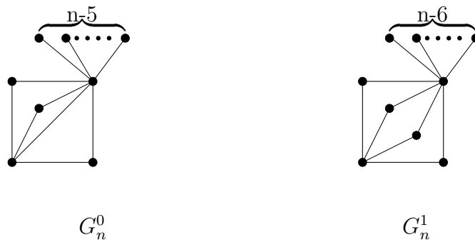
Fig.1. The graphs G_n^0 and G_n^1 .

Let \mathcal{G}_n be the class of tricyclic graph G with n vertices that contain no disjoint two odd cycles C_p, C_q with p + q \equiv 2 \pmod{4} . Denote G_n^0 as the graph obtained by connecting 3 pendent vertices to a vertex of degree 1 of the K_{1, n-1} , and G_n^1 as the graph formed by joining n - 6 pendent vertices to a vertex of degree 4 of the complete bipartite graph K_{2,4} (see Figure 1).